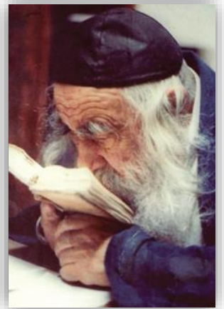
The Steipler Gaon

With a twinkle in his eye, the Rosh Yeshiva replied, "This bachur is the biggest mevakesh . This bachur has the strongest desire to learn, grow, and understand Torah. This bachur wants to get closer to Hashem and improve himself more than anyone else in the Yeshiva. Not only that but I'm sure that because of this he will outperform those other three boys even though he's not as smart as them."